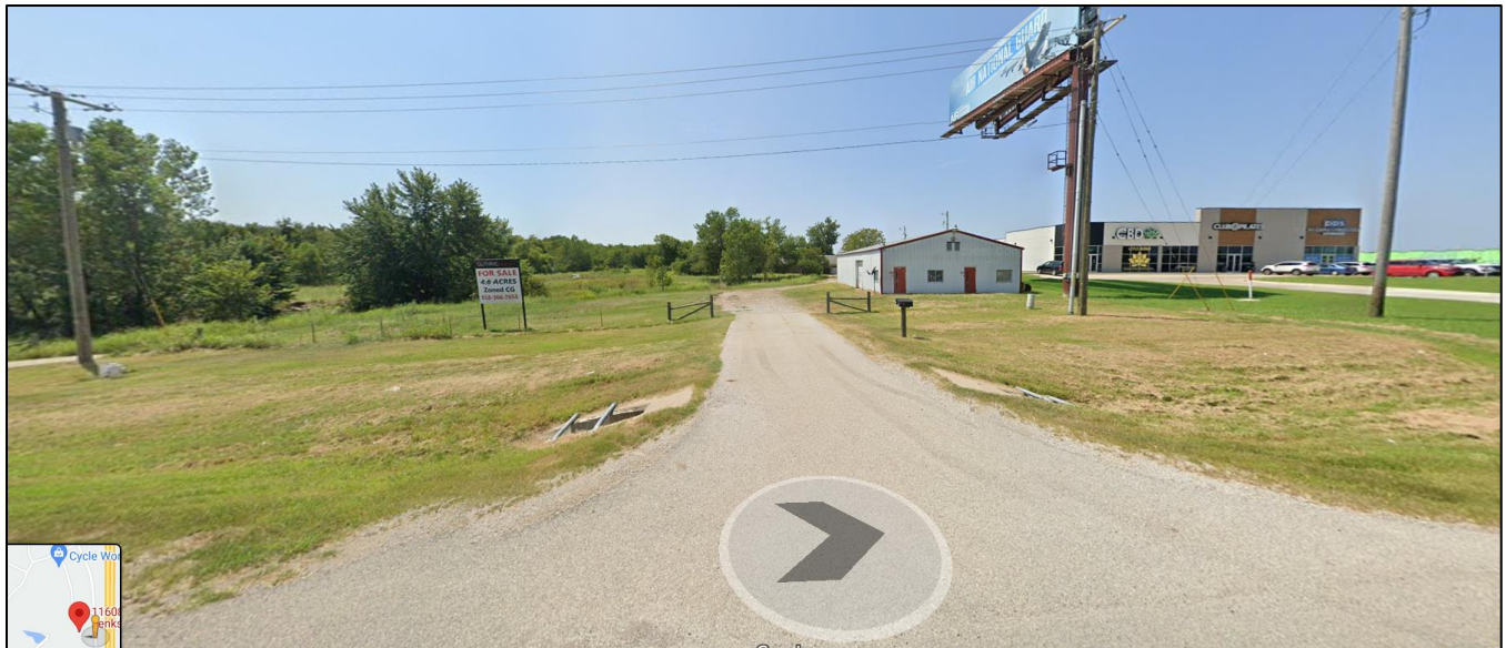
Figure 2: Street view of site